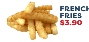
FRENCH FRIES $3.90