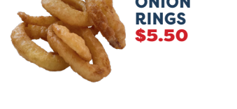
ONION RINGS $5.50