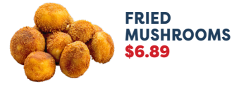
FRIED MUSHROOMS $6.89