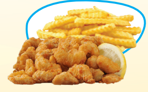
21 PIECE SHRIMP $10.99