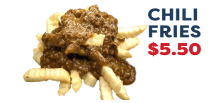
CHILI FRIES $5.50