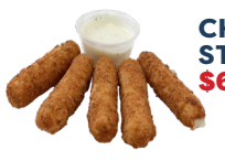
CHEESE STICKS $6.75 (5 PC.)