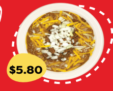
CHILI SPECIAL XTRA GROUND BEEF, CHEESE & ONIONS $5.80