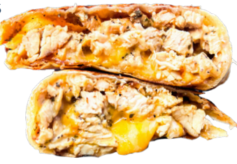
CHICKEN OR PHILLY STEAK QUESADILLA W/ Shredded Cheese $11.29 CHEESE ONLY $6.99 ADD CHILI $2.25