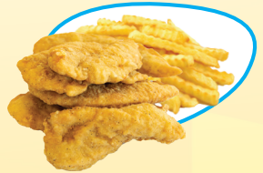
5 PC. CHICKEN TENDER $11.75