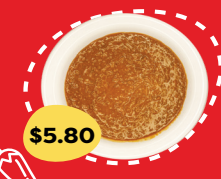
PLAIN CHILI $5.80