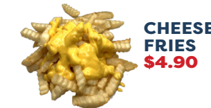
CHEESE FRIES $4.90