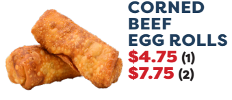
CORNED BEEF EGG ROLLS $4.75 (1) $7.75 (2)