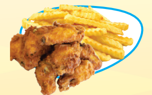
8 PC. WING DING $11.75