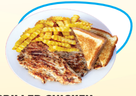
GRILLED CHICKEN BREAST $13.99