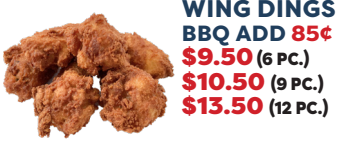
WING DINGS BBQ ADD 85¢ $9.50 (6 PC.) $10.50 (9 PC.) $13.50 (12 PC.)