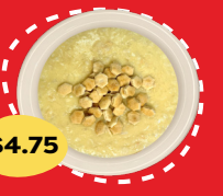
SOUP OF THE DAY $4.75