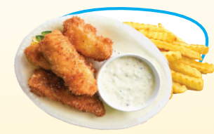
FISH AND CHIPS $12.75

DINNERS ARE SERVED WITH TEXAS TOAST AND FRENCH FRIES. CHOICE OF SALAD OR COLESLAW.