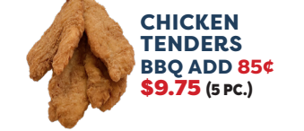
CHICKEN TENDERS BBQ ADD 85¢ $9.75 (5 PC.)