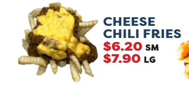
CHEESE CHILI FRIES $6.20 SM $7.90 LG